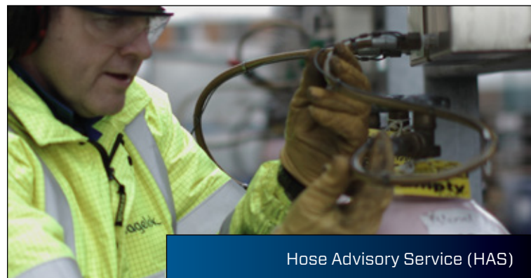
Hose Advisory Service (HAS)