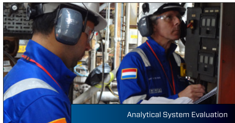
Analytical System Evaluation